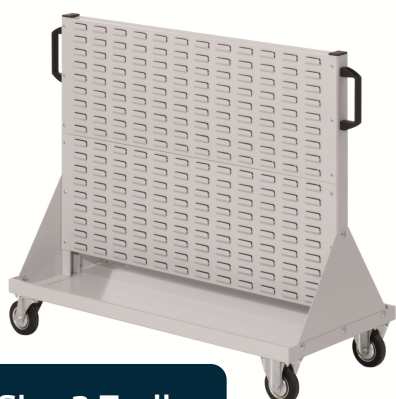
Size 2 Trolley