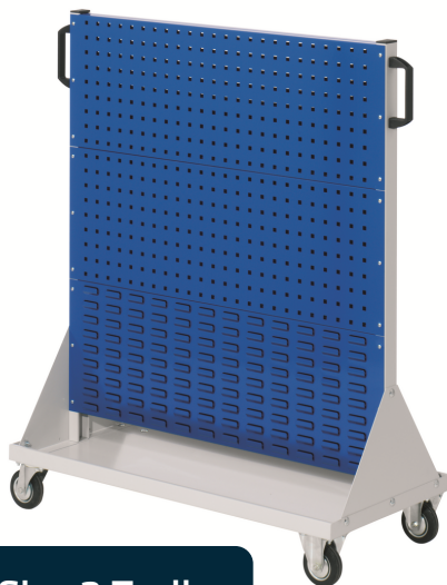
Size 3 Trolley