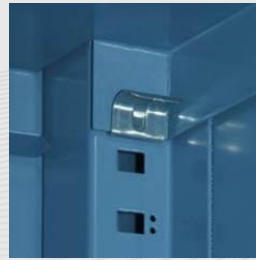
Adjustable shelving at 20mm Increments