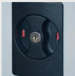
Key lockable flush mounted handle