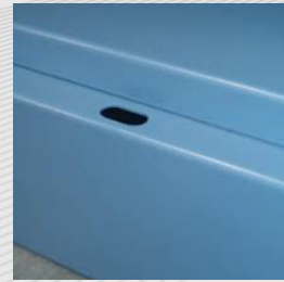
Doors fitted with triple action locking