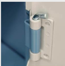
2 Concealed hinges per door

New contemporary colour scheme. New Boscotek XT Shield protective coating Boscotek XT Shield is an 'anti-mar' finish and advanced powder technology combined to protect the surface from scratches and abrasions whether in-situ or during transport.