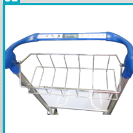
Automatic brake handle