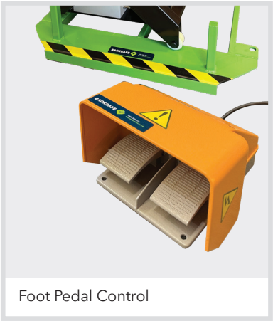
Foot Pedal Control