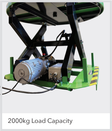
2000kg Load Capacity