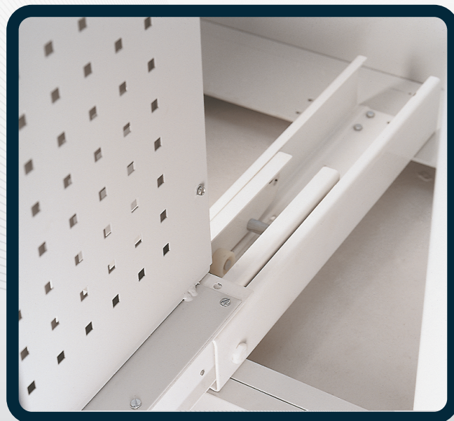
Telescopic Guide Rails

Effective Depth: 200mm each side of panel