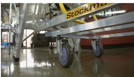
StockMaster Navigator keeps all four feet firmly on the ground unless you're moving it.