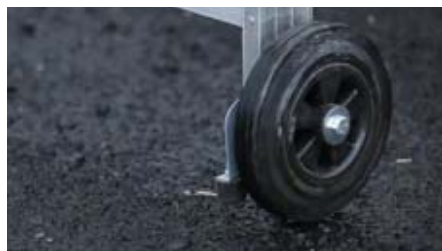
With two large diameter wheels Tracker moves easily over sealed and unsealed surfaces.