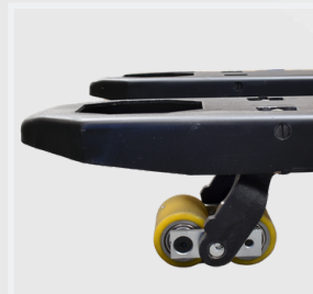
Heavy duty load rollers