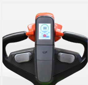
Ergonomic handle with digital display