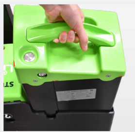
Removable Lithium battery