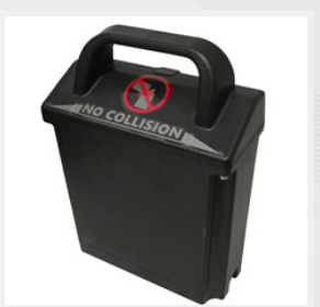
Removable Lithium battery