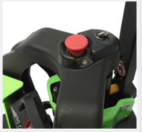
Magnetic key start