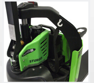
Stylish, compact drive frame