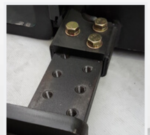
Adjustable stabiliser width