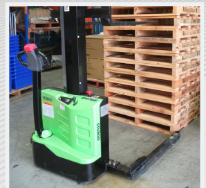
Side-positioned user control