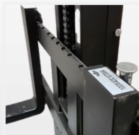
Adjustable fork width