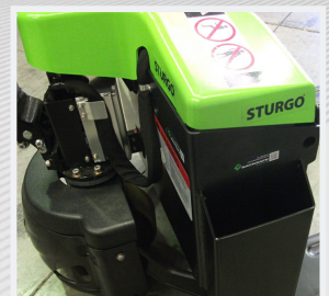
Tough and durable