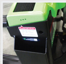
Handy pocket on both sides