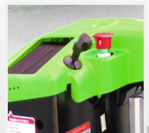
Built in battery charger